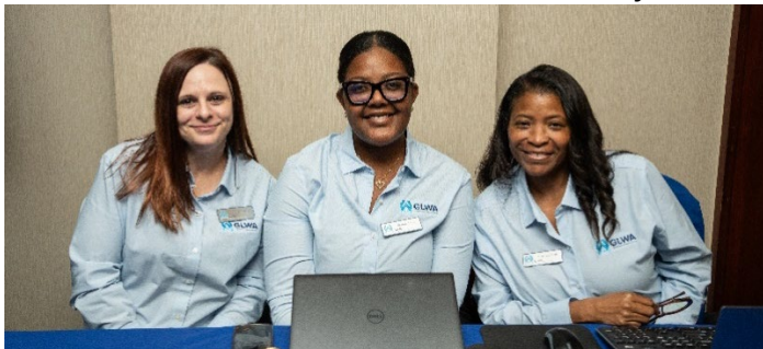
Members of GLWA's Accounts Payable Team staffed Resource Tables where vendors could ask their questions in a one-on-one setting.

Payable teams and others were also available throughout the half-day event.