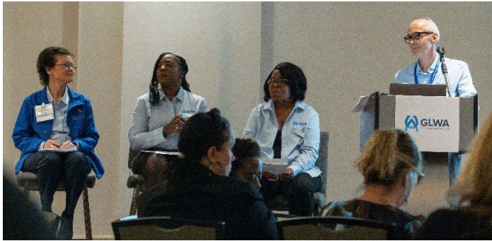
GLWA Procurement Manager and Team Leads participated in panel discussion on "How to Successfully Respond to a GLWA RFB/RFP."

The second session was services and goods focused and featured a panel discussion on how to