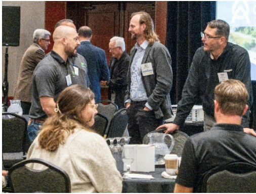
GLWA Vendors networked over breakfast before the General Session.

In this special, extended edition of the Procurement Pipeline newsletter we are excited to share photos from GLWA's 2024 Vendor Outreach event.