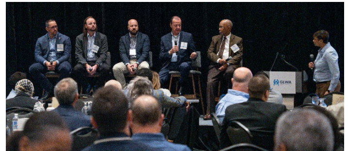
GLWA Prime Contractors participated in panel discussion on "How we Select our Subcontractors."

The General Session was followed by two Breakout Sessions. The first session featured GLWA's Capital Improvement Plan (CIP) Project Management Plan (PMP) and provided Vendors with important details and context on the CIP Plan as well as key info on upcoming project delivery schedules.