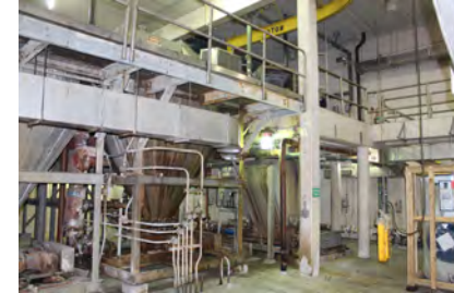
Primary Circular Scum House, Inside