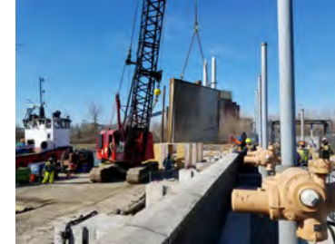
Effluent Relief Gate Repair