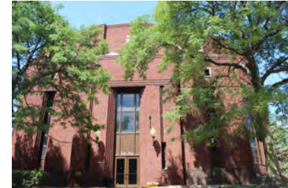
Pump Station 1