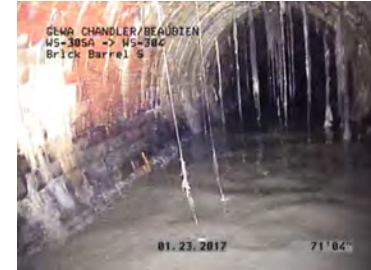
Woodward Sewer System