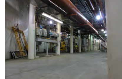
Complex B, Basement