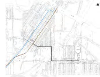
Overall Plan for NWI Diversion to Oakwood Facilities