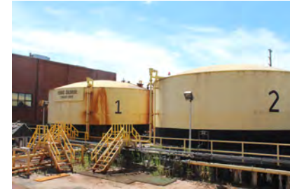
Ferric Chloride Storage and Containment Area