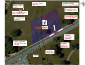
Example of Proposed Facility