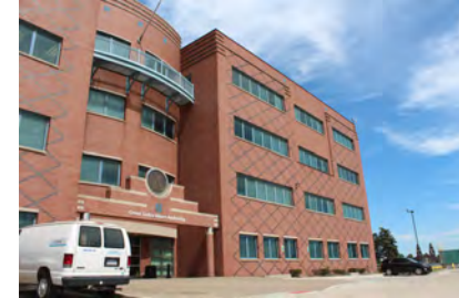
New Administration Building