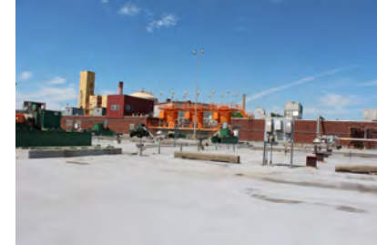
Aeration Basin 4, and ILP's 3, 4, and 7