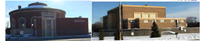
Both PSs pictures