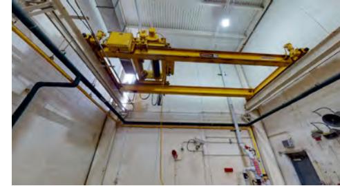
Coroded building crane from failed HVAC system