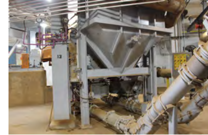
Incineration Complex II, Ash System