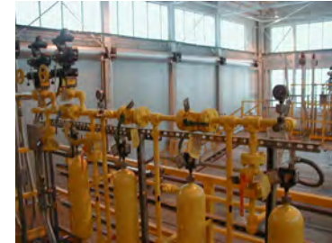
Chlorination Building, Inside