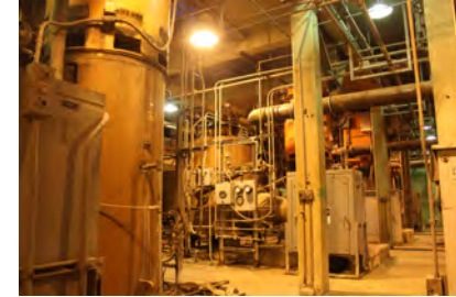
SFE Building, Basement