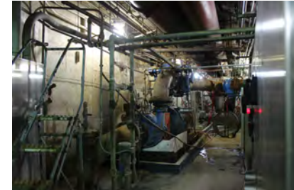
Sludge Feed pump in Complex A