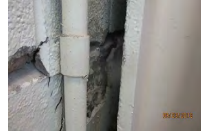
Existing Structural Condition