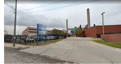
WRRF Front Entrance