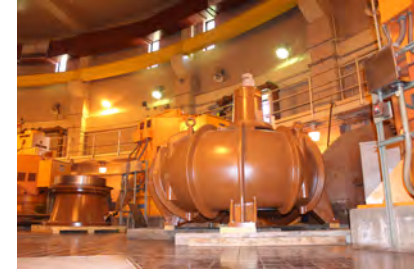
Main Raw Sewage Pumps at Pump Station 2