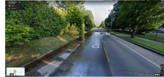
Photo of the berm leaking into Clairpointe