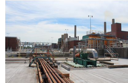
Aeration Basin 1 and ILP's 1 and 2