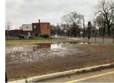
Poor Drainage at Leib