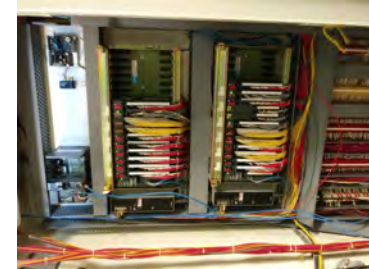
Lieb CSO, PLC Panel