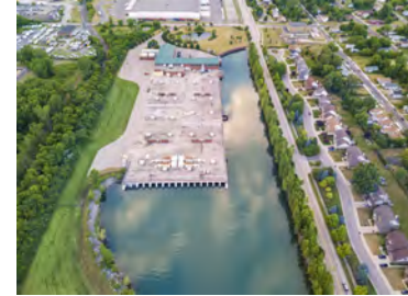
Conner Creek CSO Facility