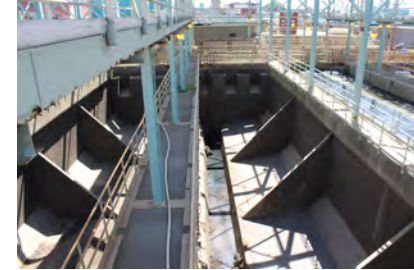
Pump Station 2, Grit channels