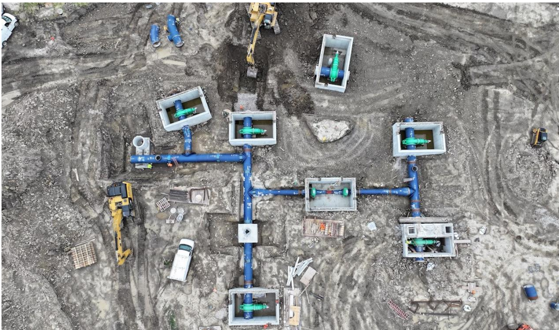
Aerial of Construction