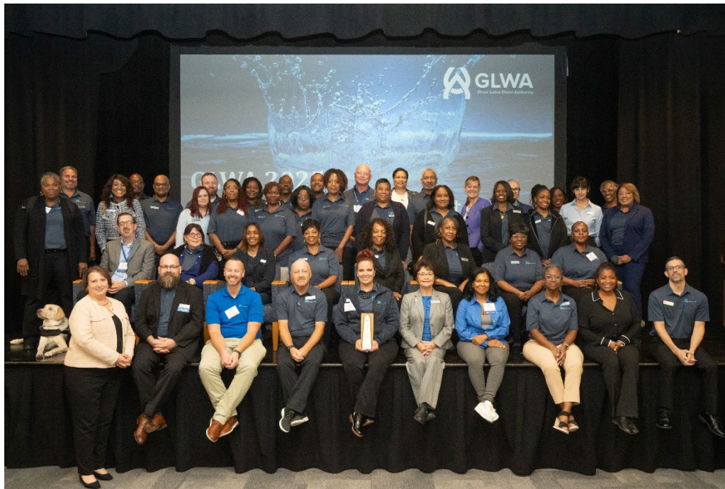
GLWA's 2025 Vendor Outreach Event