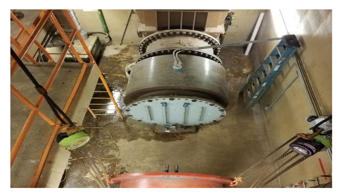
New reducing being installed.

This month the WRRF Maintenance Team would like to showcase the work being performed by the Secondary Team. A 72-inch by 48-inch reducer was replaced on the B-14 clarifier pipe that leads from the aeration deck to the main clarifier due to the old one rusting out.