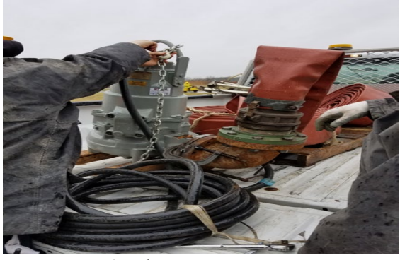
Hose dumping into Lagoon #1