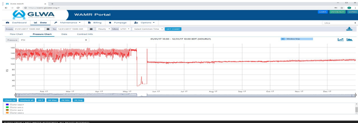
Chart 2: 2017 Average Hourly Pressure at UT-01

As previously documented, the 24-inch water main protected by this PRV vault was often operating at or above its design pressure, and above GLWA contractually specified maximums. While the repair of a 24-inch water main is not as onerous as the repair of an 84-inch water main, because of the lack of isolation, North Service Center would have to be taken out of service entirely to repair it. The likelihood and severity of a water main break along this 24-inch water main thus were both relatively high.