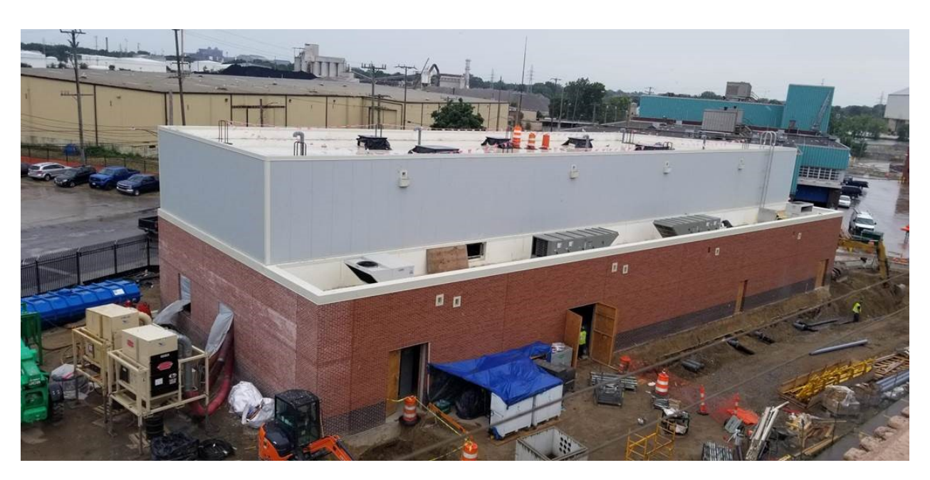
Work in and around the Hypo Building is in progress

The WRRF Design Engineering Team conducted a mandatory pre-proposal meeting and site walk-through for the RFP - Professional Engineering Services for WRRF Rehabilitation of Pump Station No. 1 Improvements. There were over 30 vendors that attended.