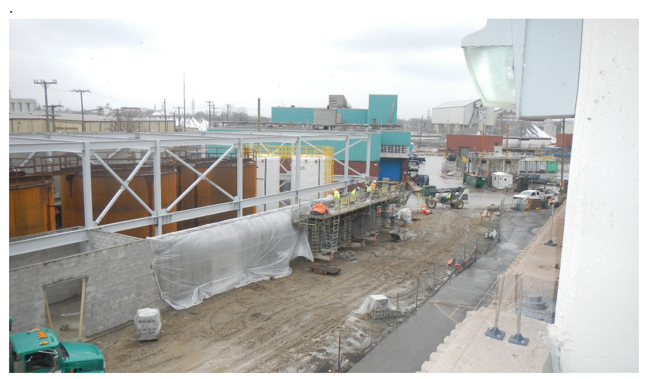
Hypo Building Construction

The construction of Rouge River Outfall Disinfection Project is progressing on schedule with a targeted construction completion date of April 1, 2019, as required by the NPDES permit. Current work efforts include the construction of the new hypo building and the installation of the chlorine piping for the secondary diffusers. WRRF Engineering is evaluating "green" parking lot improvements that if selected will be incorporated into the rebuilding of the parking lot in front of the New Administration Building.