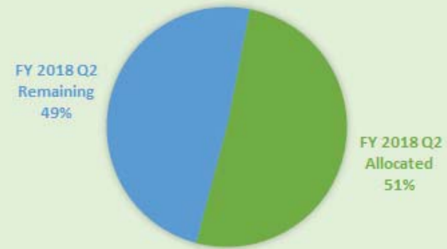
SEWER PROGRAM & ALLOWANCE ALLOCATIONS THROUGH DECEMBER 31, 2017