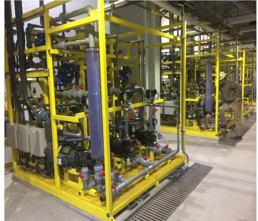
Chemical Feed Pump Skids