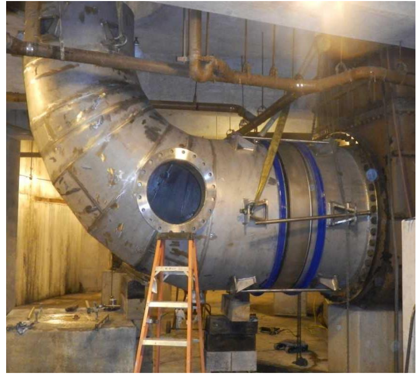
Suction Elbow Installation