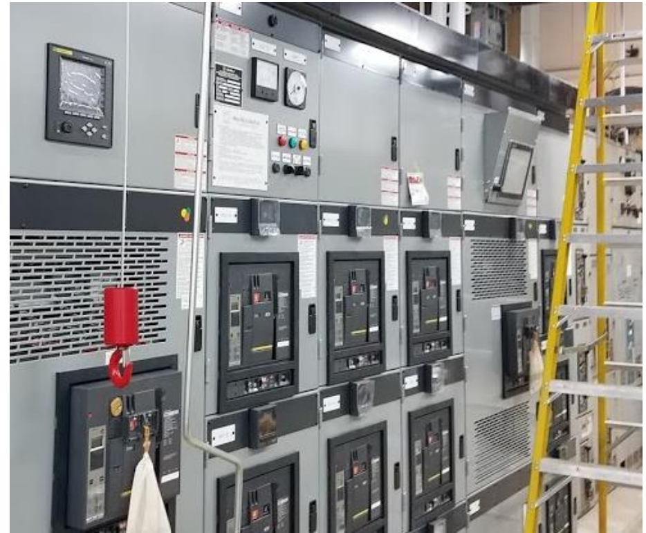
New Electrical Substation