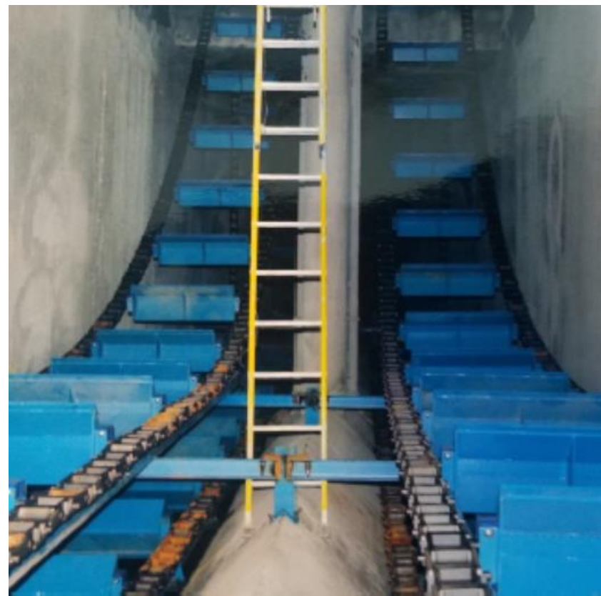
New Grit Collector