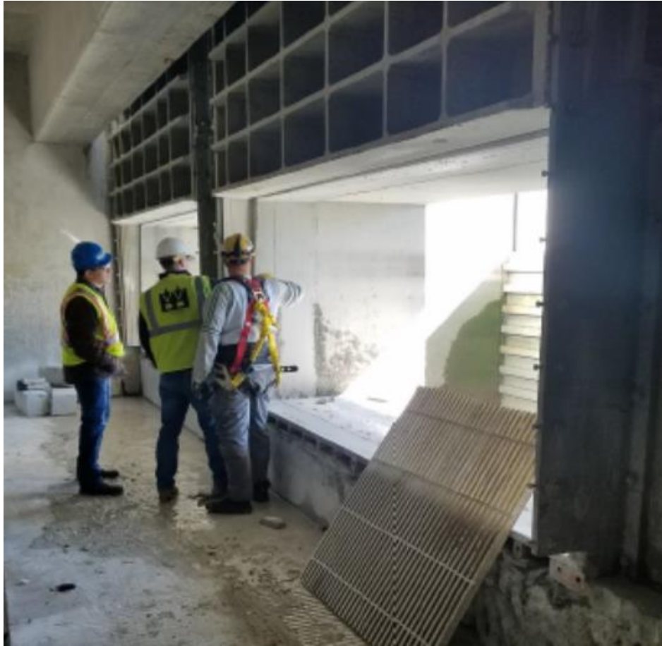
Effluent Launder Gates