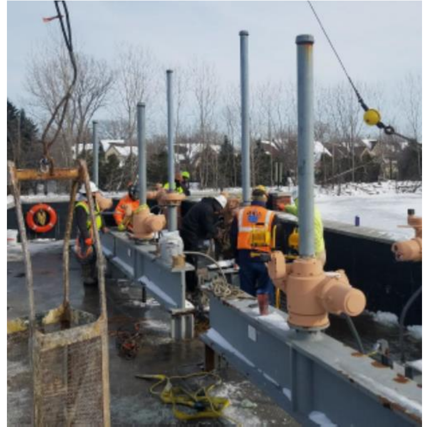
Effluent Gate Actuators