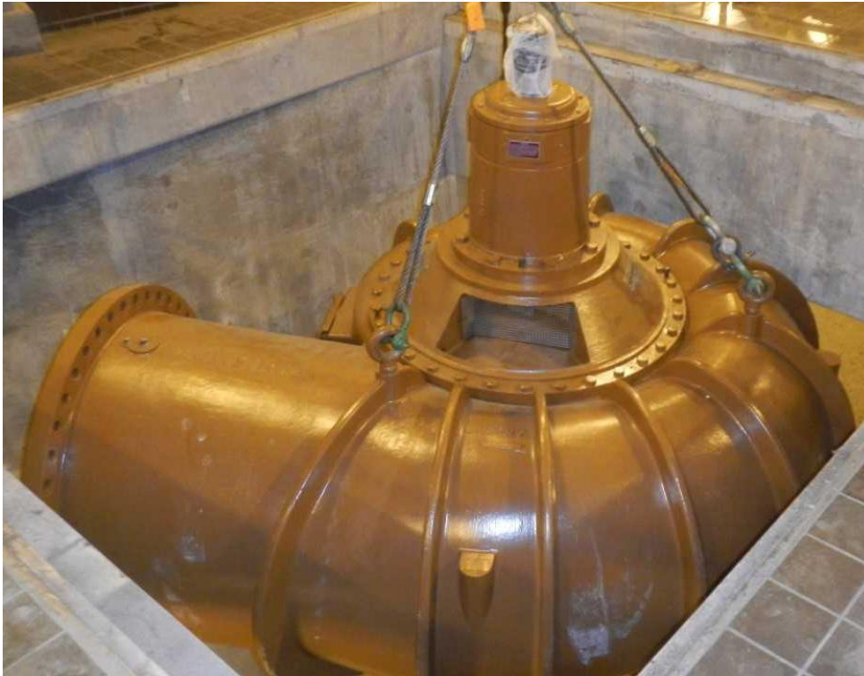
Lowering New Pump into Position