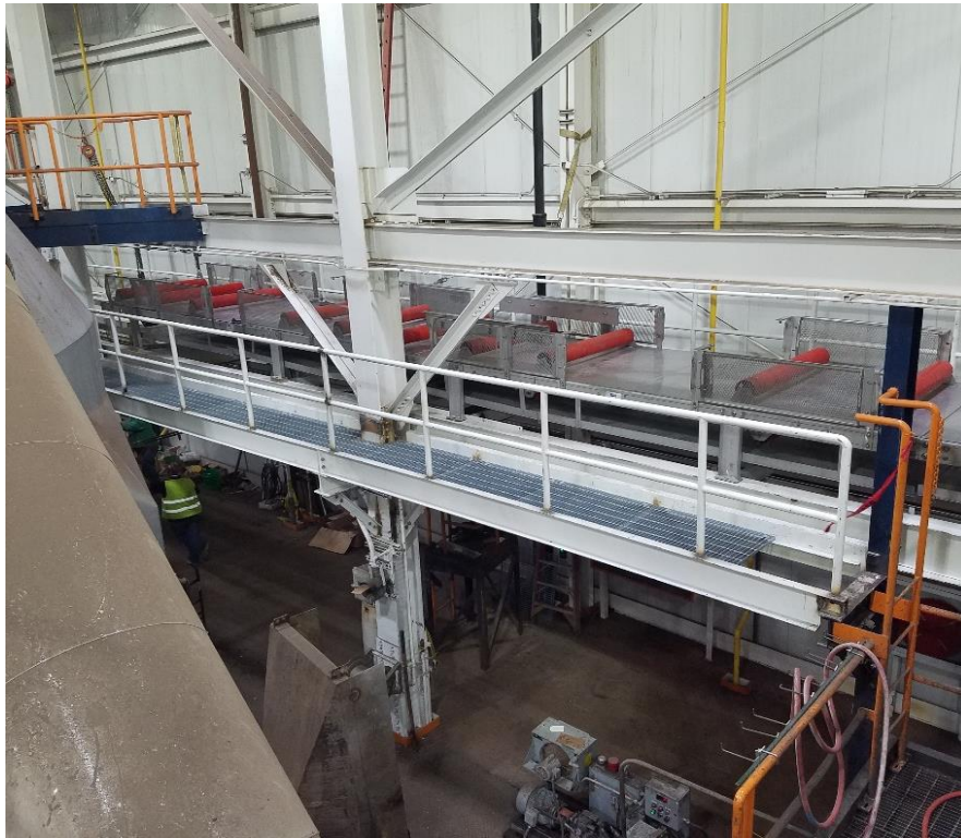
New L Sludge Conveyor