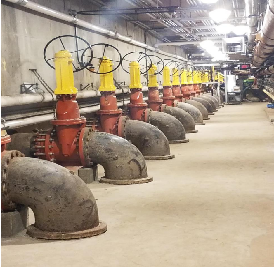
Influent Gate Valves in Pipe Gallery