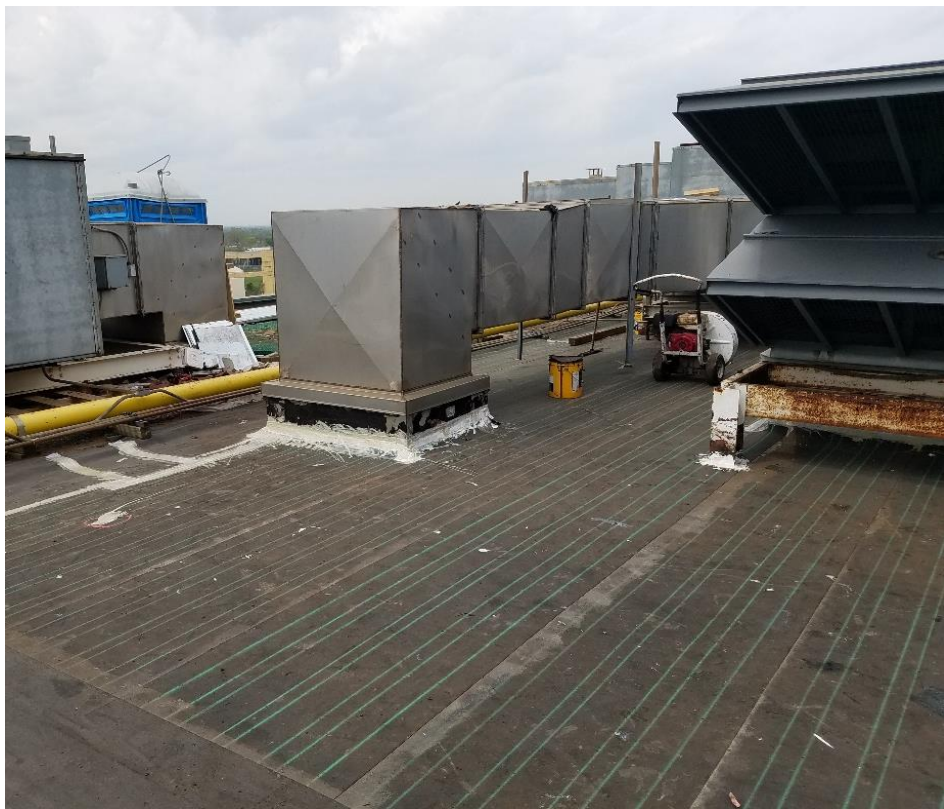
New Roof Structure Around Existing HVAC