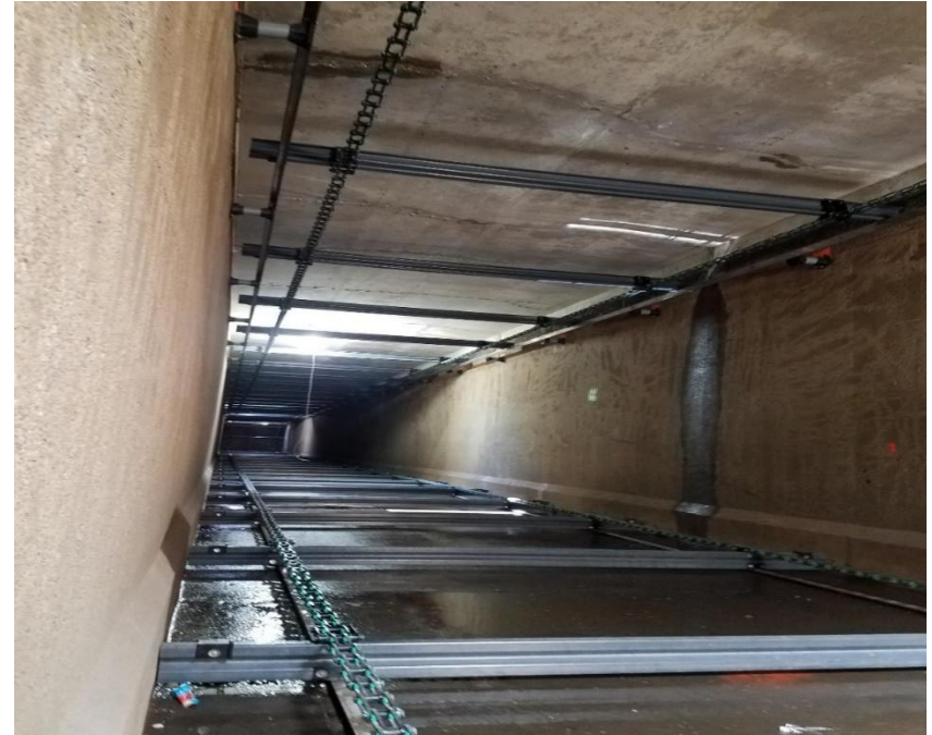
New Scum Conveyor System