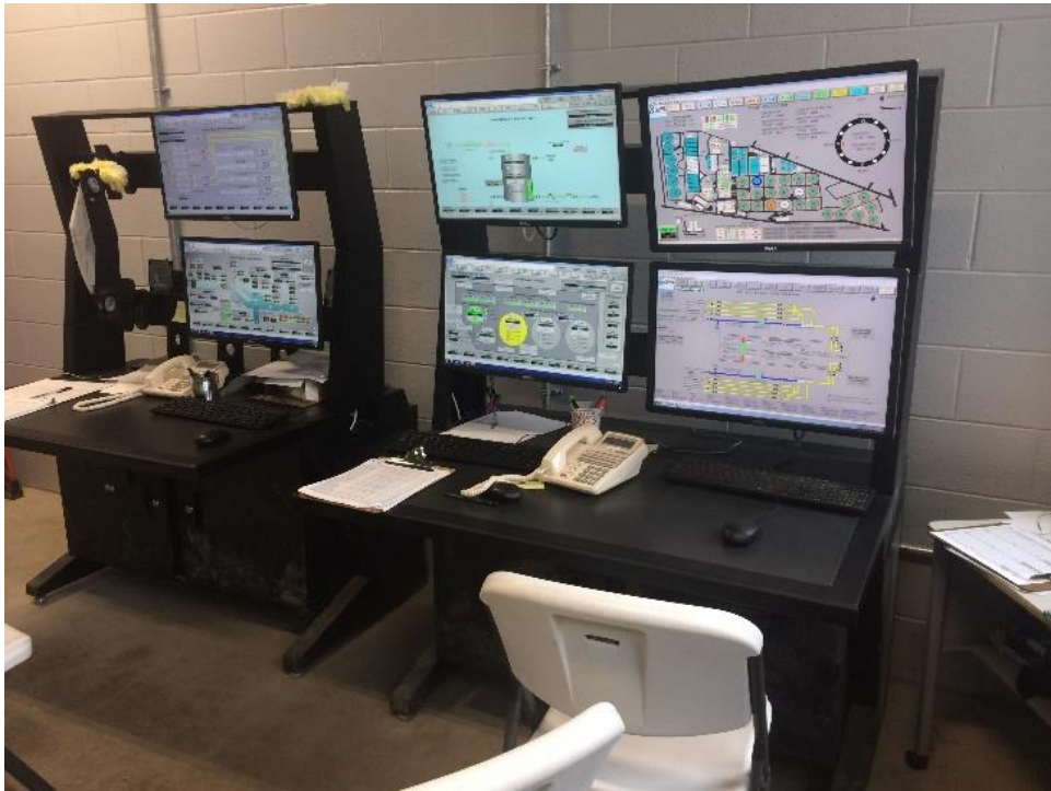
Hypo Building Control Room