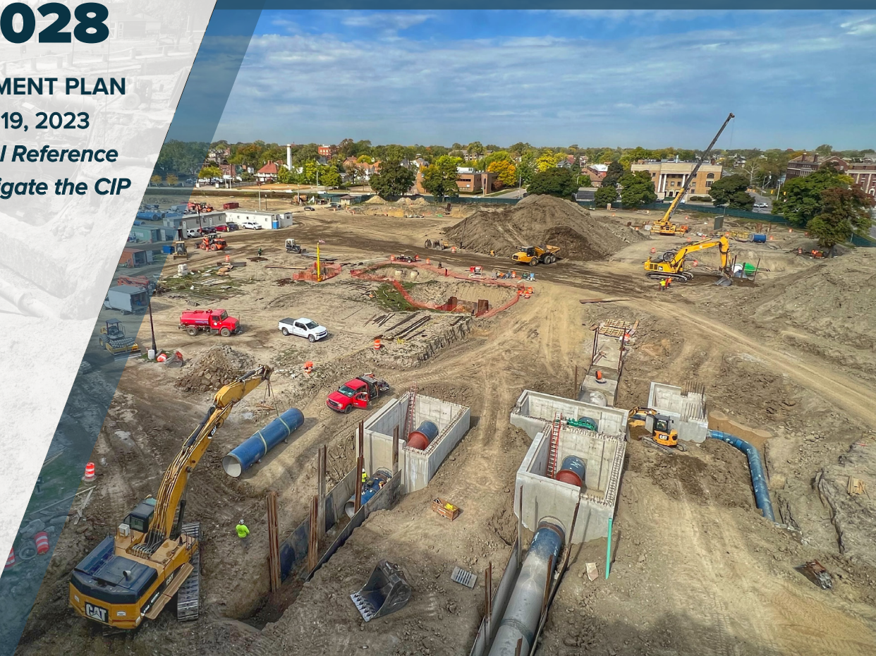
Water Works Park Water Treatment Plant Yard Piping, Valves, and Venturi Meters Replacement