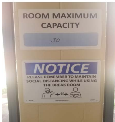
Social Distancing At WRRF