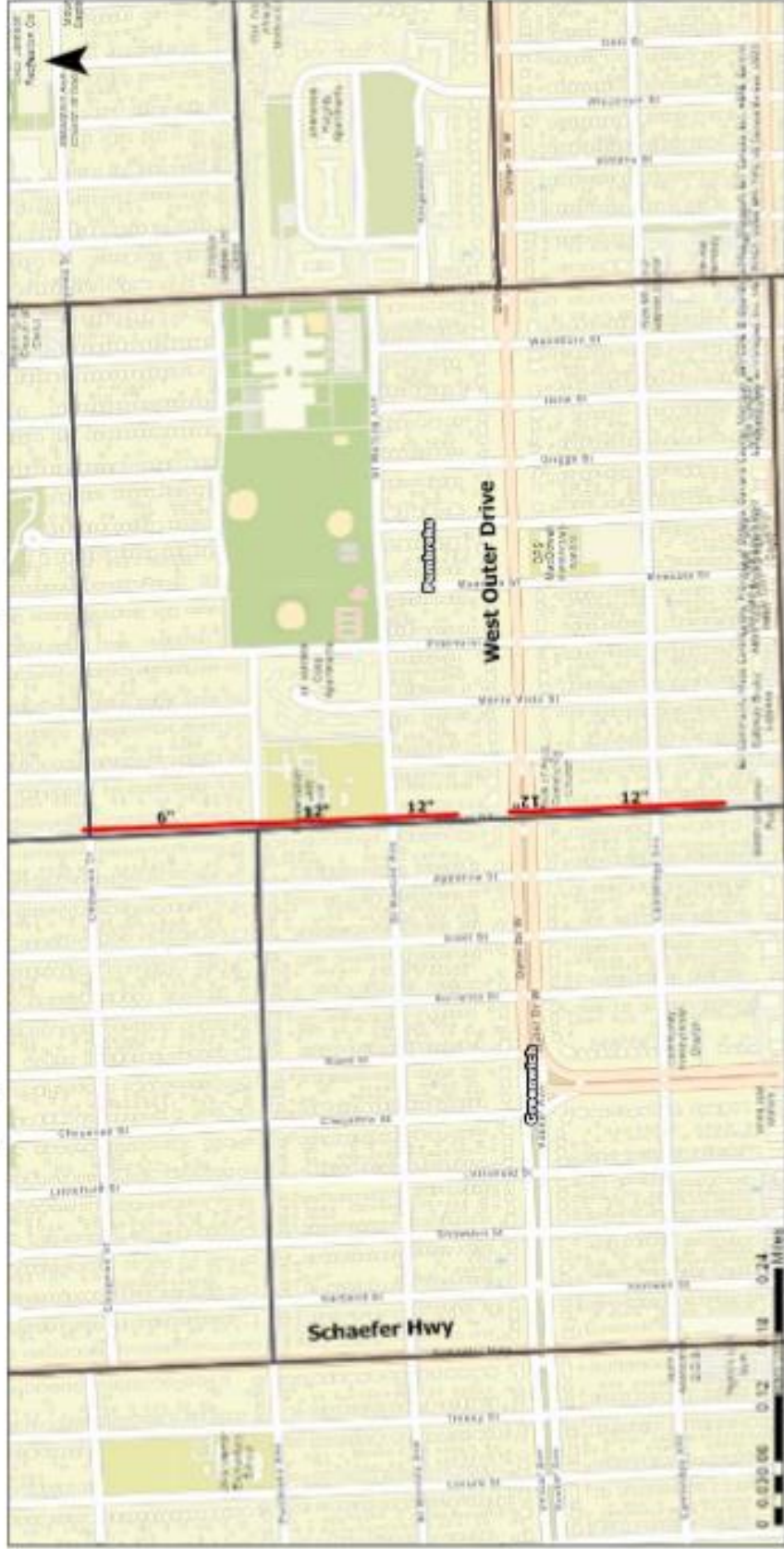
Detroit Northwest Side - Council District 2 - Watermains on Meyers Rd