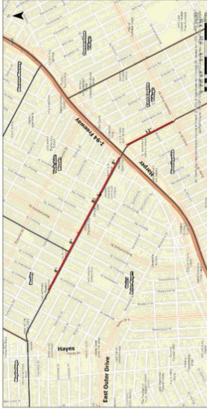
Detroit Northeast Side - Council District 4 - Watermains on Whittier