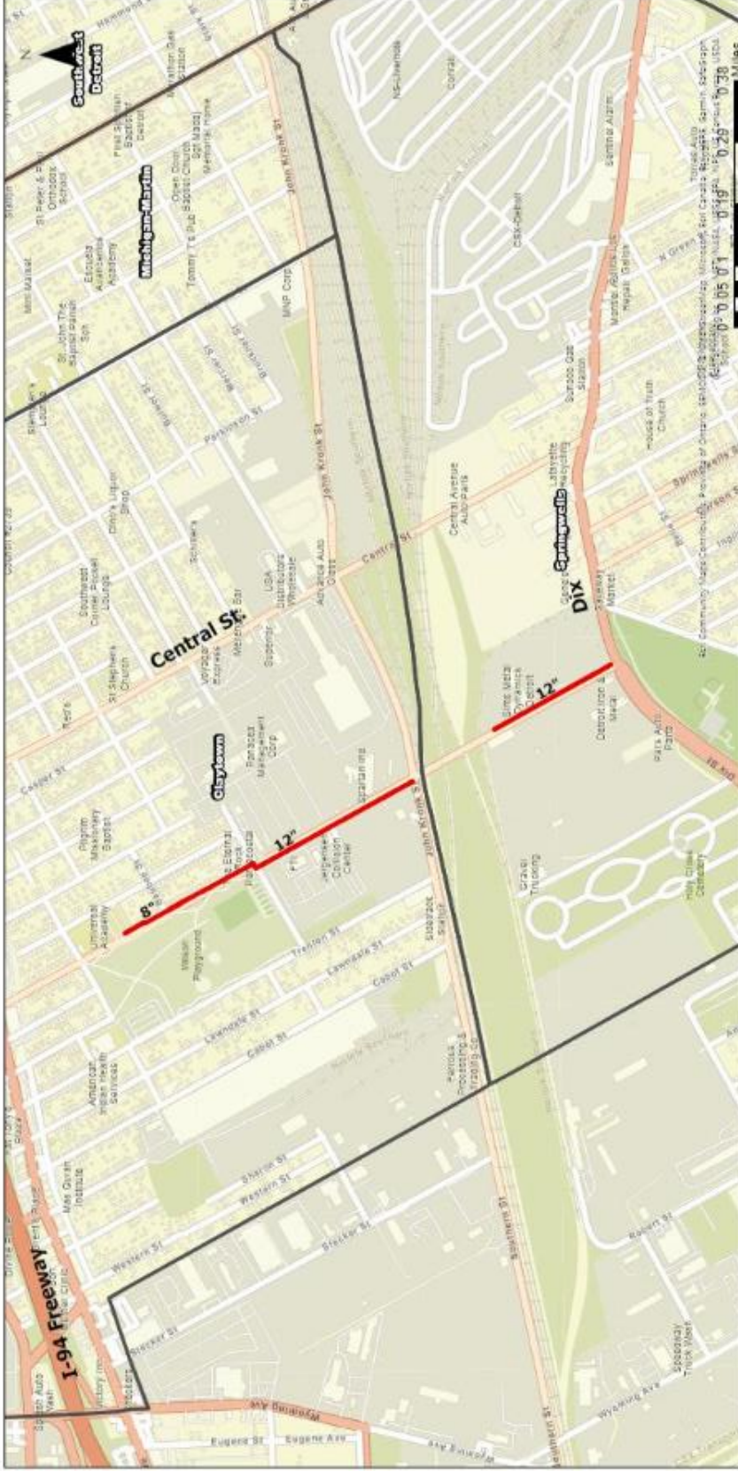
Detroit Southwest Side - Council District 6 - Watermains on John Kronk