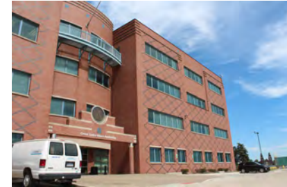
New Administration Building