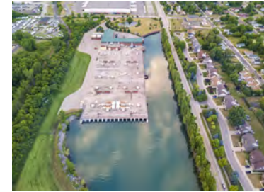
Conner Creek CSO Facility