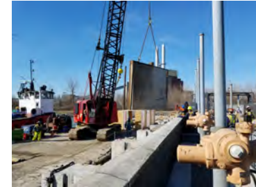
Effluent Relief Gate Repair