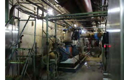
Sludge Feed pump in Complex A