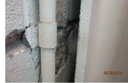
Existing Structural Condition