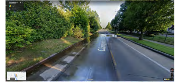
Photo of the berm leaking into Clairpointe