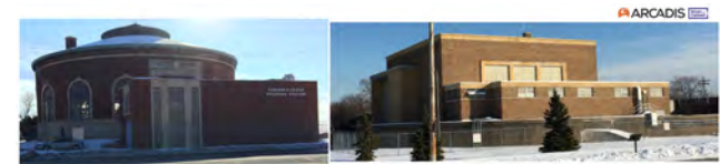
Both PSs pictures