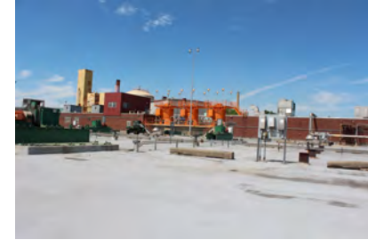
Aeration Basin 4, and ILP's 3, 4, and 7