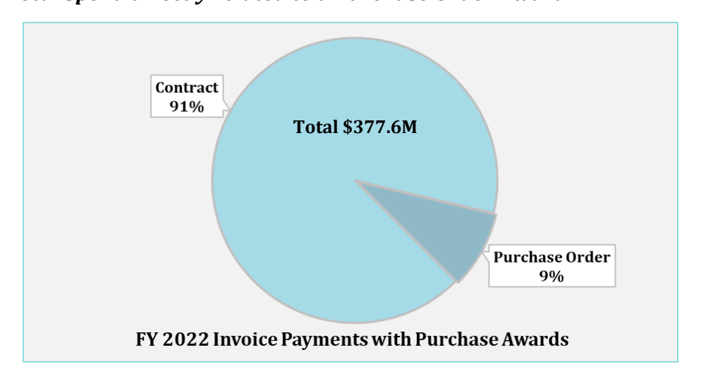
Chart 2 - Total Spend directly related to a Purchase Order Award

Chart 2 – Total Spend directly related to a Purchase Order Award (with or without a Contract). This chart emphasizes Procurement's focus on identifying opportunities to capture as much spend as possible under the safeguards of a formal contract. The majority, 91% of all purchase orders and 78% of all GLWA spend, is directly related to a contract.