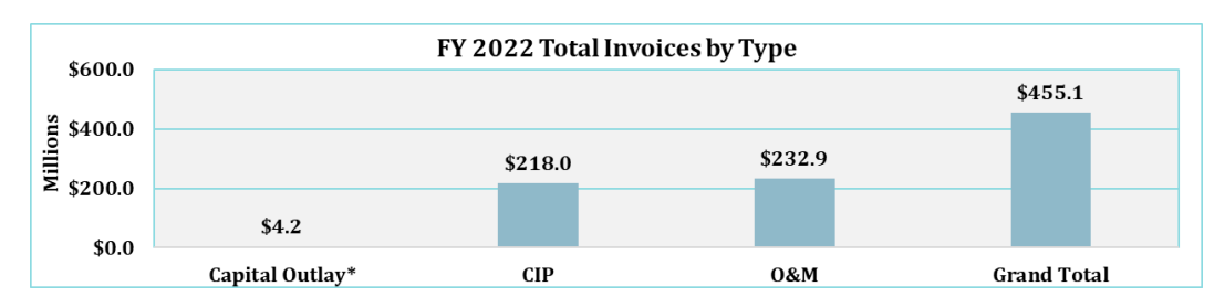
Chart 3 - Total Spend by Expense Type

Chart 3 – Total Spend by Expense Type organizes the spend between Operations and Maintenance (O&M), Capital Improvement Plan (CIP), and Capital Outlay.