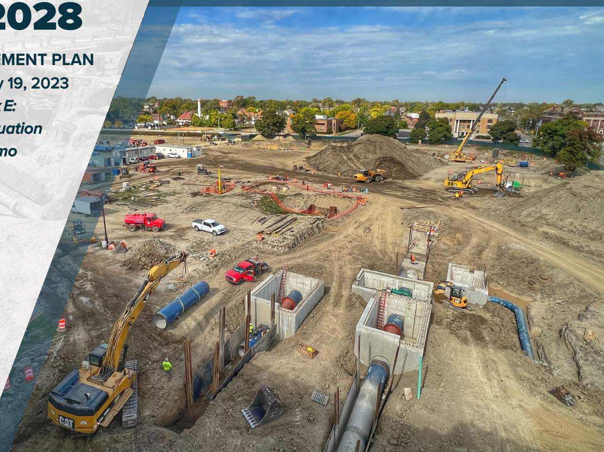
Water Works Park Water Treatment Plant Yard Piping, Valves, and Venturi Meters Replacement