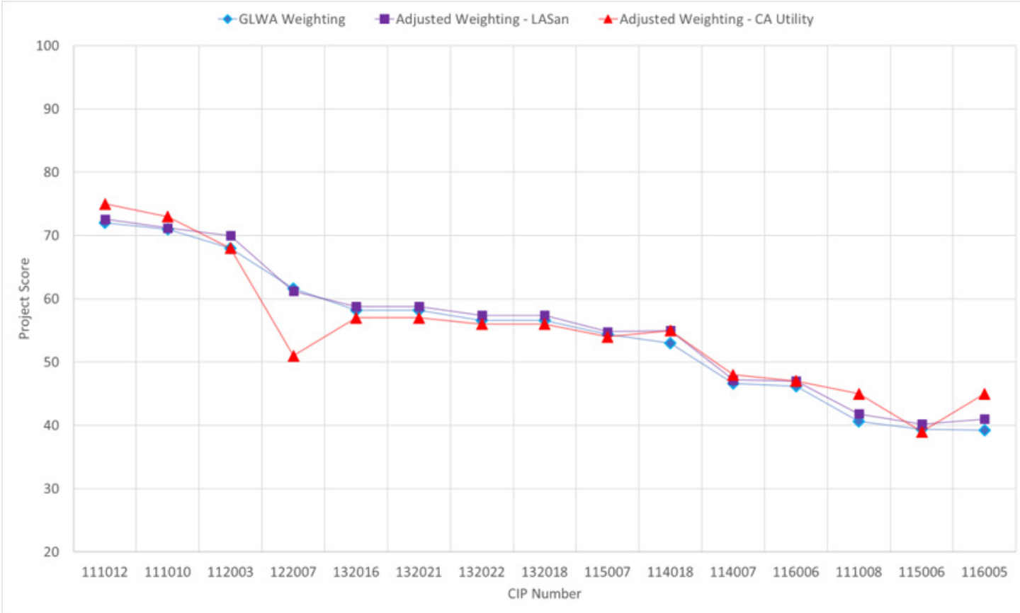
Figure 2-1: Criteria Weighting Comparison